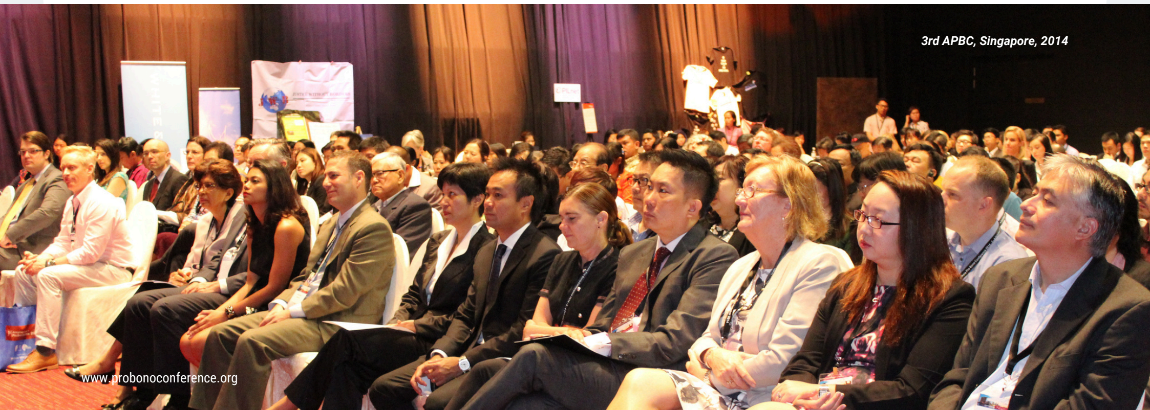
3rd APBC, Singapore, 2014

Japan is chosen due to the strong and effective Pro Bono, Access to Justice and Rule of Law initiatives currently being implemented throughout the country. In organizing the event this year, similar to other years past, there will be a diverse Local Organizing Committee (LOC), comprised of key actors in Japan justice sectors. This LOC will work alongside, and in collaboration with the APBC & A2JX Secretariat.